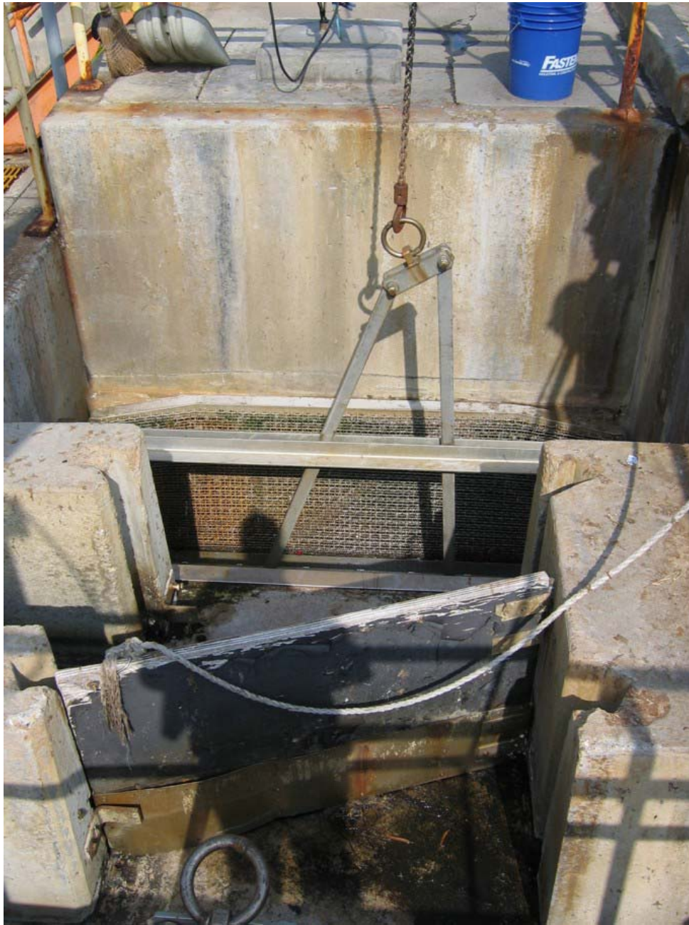
Figure B4-2. One of the Unit 7&8 collection baskets.